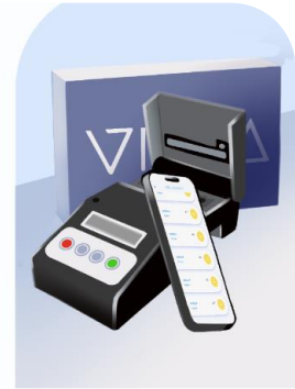
Adoption Impact Testing